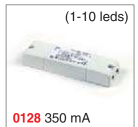
0128 350 mA

SOLO COLLEGAMENTO IN SERIE - ONLY SERIAL CONNECTION - ESCLUSIVEMENT MONTAGE EN SERIES - NUR SERIENVERBINDUNG - pag. 112