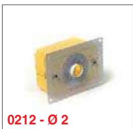
0212 - Ø 2