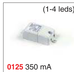
0125 350 mA