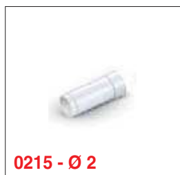
0215 - Ø 2